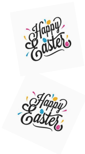
Shahid Y4 Lower KS2 WINNER